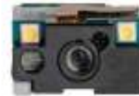
TC8XXX-2 Medium Range Imager