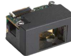
TC8XXX-A 1D Standard Range Laser