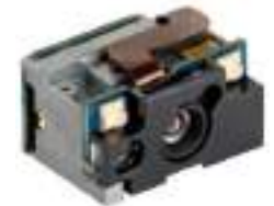
TC8000-1 Standard Range Imager