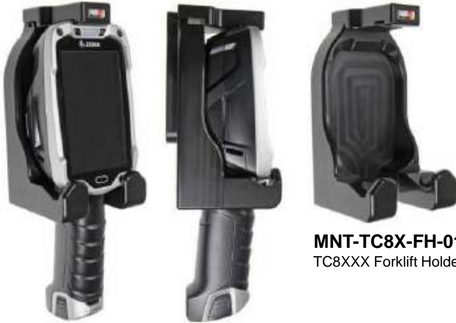
MNT-TC8X-FH-01 TC8XXX Forklift Holder

Forklift Mount – Standard (Available Q3, 2019)