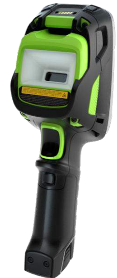
TC83XX-4/5 DPM Imager w/ light diffusion *