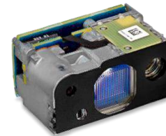
TC8XXX-3 Extended Range Imager