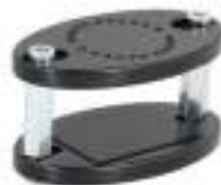
3PTY-PCLIP-215677 Forklift Clamp Mount