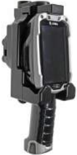
MNT-TC8X-FLCH-01 Forklift Holder for TC8000