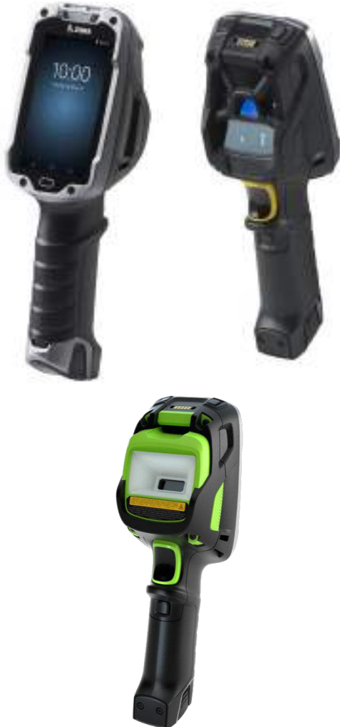
TC8300 DPM w/ light diffusion *