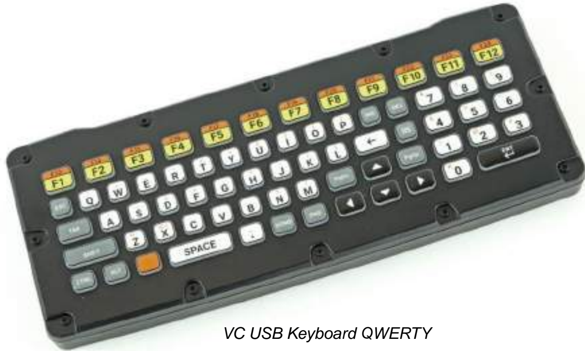
VC USB Keyboard QWERTY