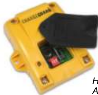
Havis Charge-Guard Auto Shutoff Timer