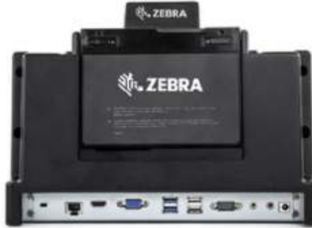
Back view showing optional battery charger (top) and I/O connectivity (bottom)