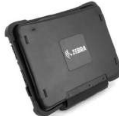
Keyboard in closed position via magnets, protecting display glass