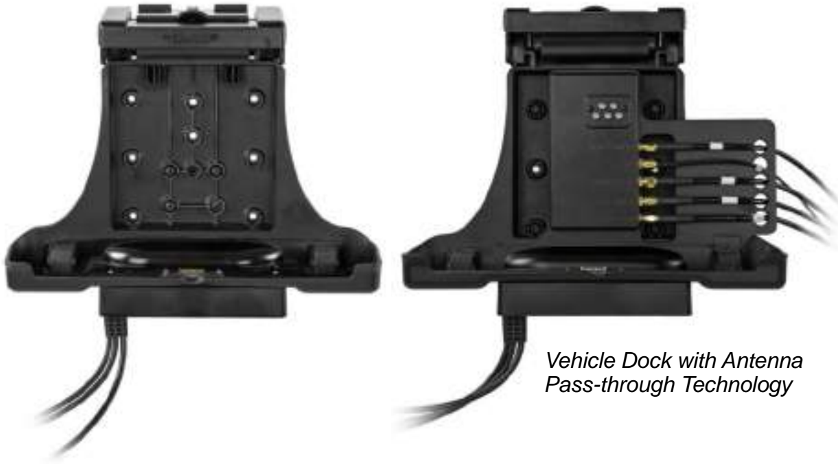
Vehicle Dock with Antenna Pass-through Technology