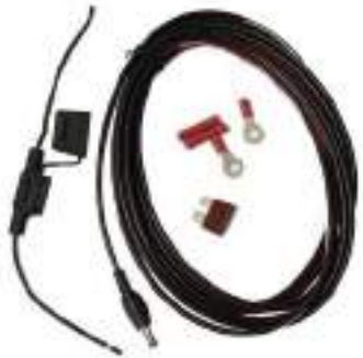
Direct Wire Power Cable Kit