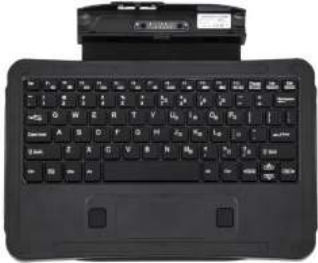
Rugged IP65 keyboard with backlighting

420095 (Rugged Companion Keyboard – US) 420096 (Rugged Companion Keyboard – UK) 420097 (Rugged Companion Keyboard – DE) 420098 (Rugged Companion Keyboard – FR) 420099 (Rugged Companion Keyboard – ES)