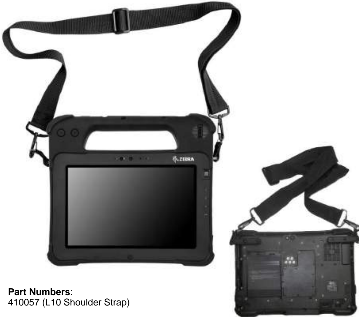
Part Numbers: 410057 (L10 Shoulder Strap)

The shoulder strap includes brackets to attach to Zebra XPAD or XSLATE L10 tablets. It is ideal for hands-free, long-distance carrying, and it is adjustable for height. The wide strap enhances comfort and can be easily attached and detached via clips.