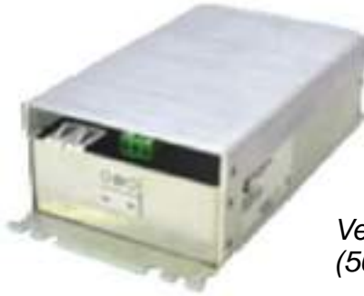
Vehicle Power DC Converter (50-150V or 9-60V)